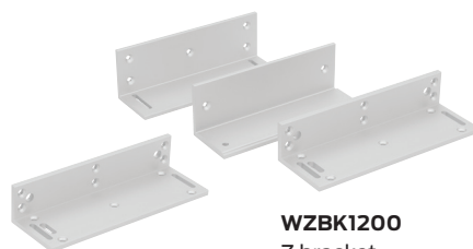
WLBK1200 L bracket